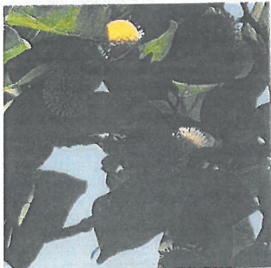
of flowers. #ayrQLD #myburdekin #visitburdekin

Only if they are too close to homes and people. Out bush or on isolated beaches leave them it's their habitat. Put up signs in those places. Chris Terry